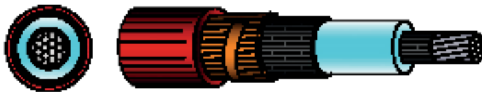
Unipolare Estruso Fili – Single Core Polymeric Wire

Conforme a norme/Compliant with standards CENELEC HD 629.1 S3, CEI 20-62/